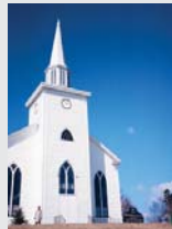
Union Presbyterian Church

Join with other elders and lay leaders of The Presbyterian Church in Canada for a day of learning with experienced facilitators.