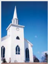
Union Presbyterian Church

Join with other elders and lay leaders of The Presbyterian Church in Canada for a day of learning with experienced facilitators.